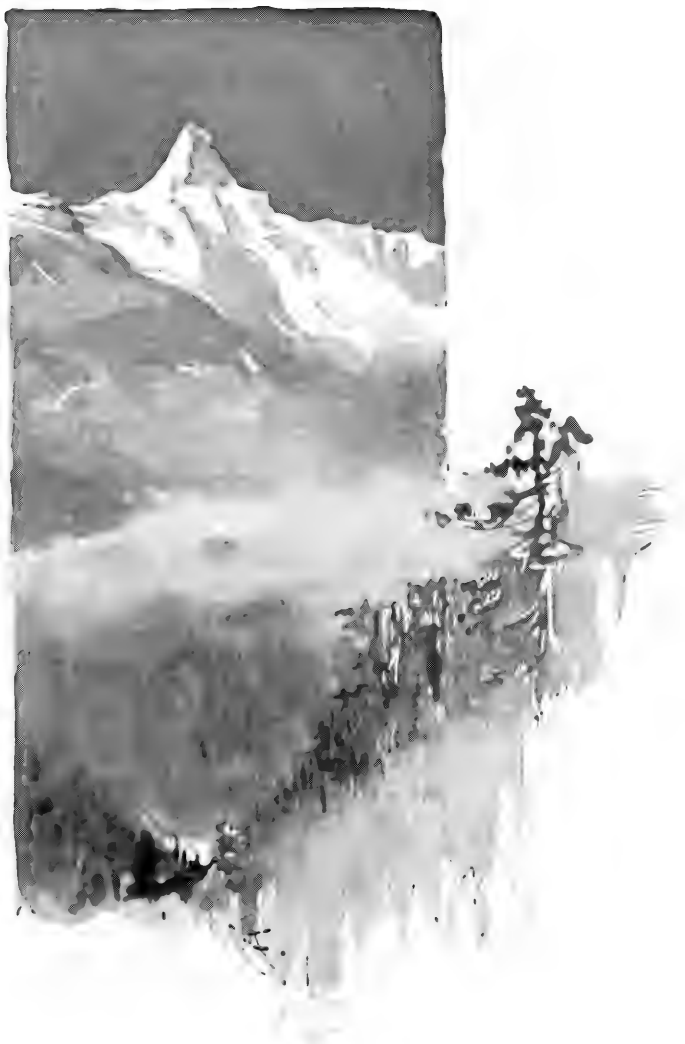
"LATE SHINES THE DAY'S DEPARTING LIGHT."—Page 123.